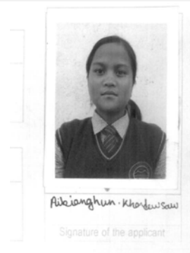
Controller of Examinations, Meghalaya Board of School Education, Tura

Note: Head of the Institution should countersign along with seal before issuing to students.