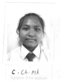
Controller of Examinations, Meghalaya Board of School Education, Tura

Note: Head of the Institution should countersign along with seal before issuing to students.