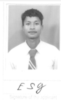
Controller of Examinations, Meghalaya Board of School Education, Tura

Note: Head of the Institution should countersign along with seal before issuing to students.