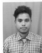
S km Signature of the Applicant

Controller of Examinations, Meghalaya Board of School Education, Tura