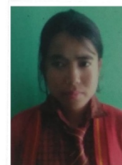
WandaShisha Signature of the applicant

Tick (✓) in the box provided if candidate wishes to appear in all the subjects as Non-Regular.