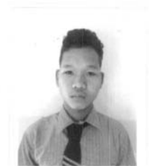
Lohibath ch Mk

IMPORTANT: Back page of this NON-REGULAR form should be printed, and signed by all concern before submitting to the Board.