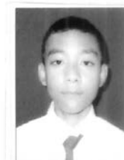
Vernious Signature of the candidate

Tick (✓) in the box provided if candidate wishes to appear in all the subjects as Non-Regular.