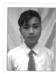
P. Paliar Signature of the applicant

Tick (✓) in the box provided if candidate wishes to appear in all the subjects as Non-Regular.