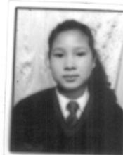
I. Muktieh Signature of the candidate

Tick (✓) in the box provided if candidate wishes to appear in all the subjects as Non-Regular.