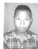
T. D. M.

Tick (✓) in the box provided if candidate wishes to appear in all the subjects as Non-Regular.