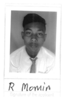
R Momin Signature of the candidate

Tick (✓) in the box provided if candidate wishes to appear in all the subjects as Non-Regular.