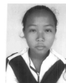
D'Ch' mo min

Tick (✓) in the box provided if candidate wishes to appear in all the subjects as Non-Regular.