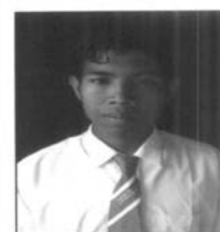
Imran k mar

Tick (✓) in the box provided if candidate wishes to appear in all the subjects as Non-Regular.