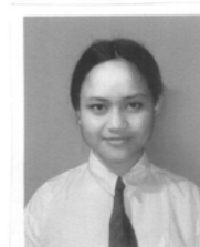
T. K. dup

Tick (✓) in the box provided if candidate wishes to appear in all the subjects as Non-Regular.