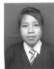
I. Khongwar Candidate No: 48190

Tick (✓) in the box provided if candidate wishes to appear in all the subjects as Non-Regular.