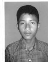
WALMA CH.M Signature of the candidate

Tick (✓) in the box provided if candidate wishes to appear in all the subjects as Non-Regular.