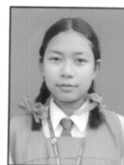
D. D. S.

IMPORTANT: Back page of this REGULAR form should be printed, and signed by all concerned before submitting to the Board.