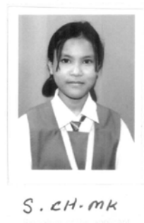
S. CH. MK

IMPORTANT: Back page of this REGULAR form should be printed, and signed by all concerned before submitting to the Board.