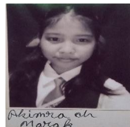
Akimra ch marak

IMPORTANT: Back page of this REGULAR form should be printed, and signed by all concerned before submitting to the Board.