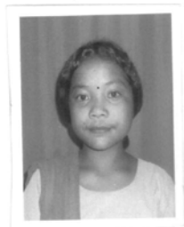
P. ch. mom

IMPORTANT: Back page of this REGULAR form should be printed, and signed by all concerned before submitting to the Board.