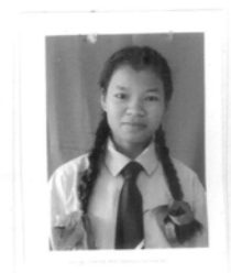
PHOTO COPY OF UDID CARD

IMPORTANT: Back page of this REGULAR form should be printed, and signed by all concerned before submitting to the Board.