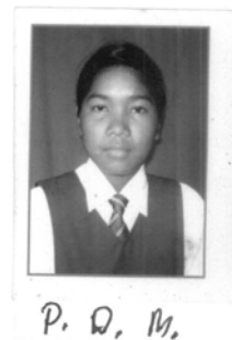
P. D. M.

IMPORTANT: Back page of this REGULAR form should be printed, and signed by all concerned before submitting to the Board.