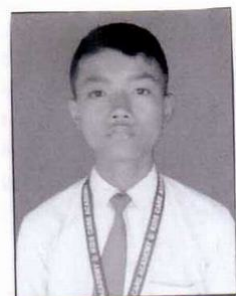
Mingan Ch. Mk

IMPORTANT: Back page of this REGULAR form should be printed, and signed by all concerned before submitting to the Board.