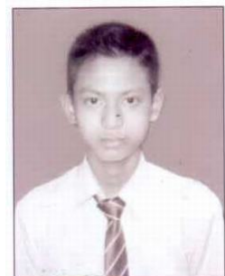
Ch. A Sq.

IMPORTANT: Back page of this REGULAR form should be printed, and signed by all concerned before submitting to the Board.