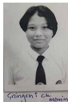
Gningchi ch momin

IMPORTANT: Back page of this REGULAR form should be printed, and signed by all concerned before submitting to the Board.