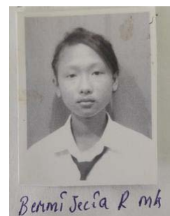
Bermi Jecia R mk

IMPORTANT: Back page of this REGULAR form should be printed, and signed by all concerned before submitting to the Board.