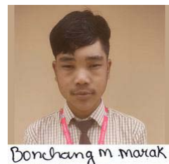
Bonchang m marak

IMPORTANT: Back page of this REGULAR form should be printed, and signed by all concerned before submitting to the Board.