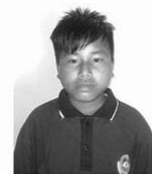
S. N. M. K.

IMPORTANT: Back page of this REGULAR form should be printed, and signed by all concerned before submitting to the Board.