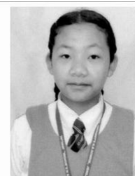
Bijime deva D. sg

IMPORTANT: Back page of this REGULAR form should be printed, and signed by all concerned before submitting to the Board.