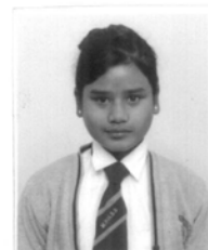
Photo of the Candidate

IMPORTANT: Back page of this REGULAR form should be printed, and signed by all concerned before submitting to the Board.