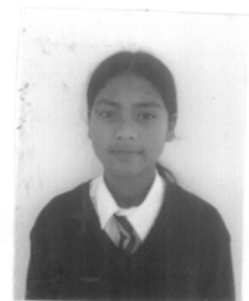
V. MotSun. w

IMPORTANT: Back page of this REGULAR form should be printed, and signed by all concerned before submitting to the Board.