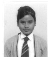
PHOTO COPY OF UDID CARD

IMPORTANT: Back page of this REGULAR form should be printed, and signed by all concerned before submitting to the Board.