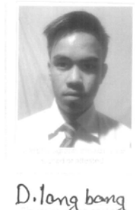
D. lang bang

IMPORTANT: Back page of this REGULAR form should be printed, and signed by all concerned before submitting to the Board.